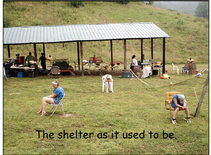
The shelter as it used to be.

When the storms came through, they took the top of the picnic shelter off,