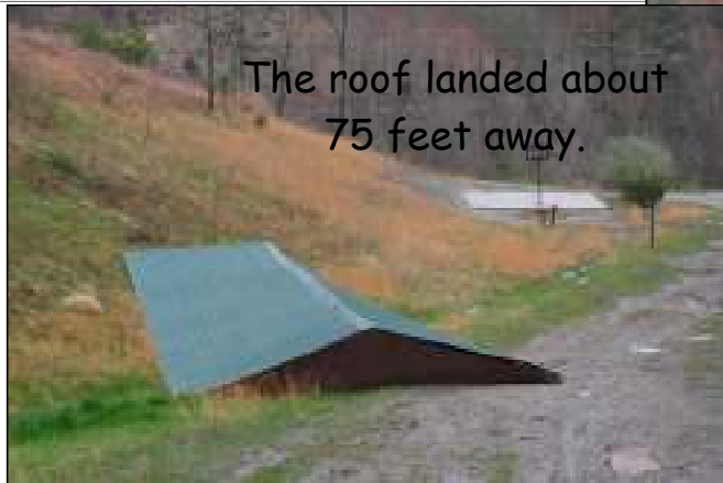
The roof landed about 75 feet away.